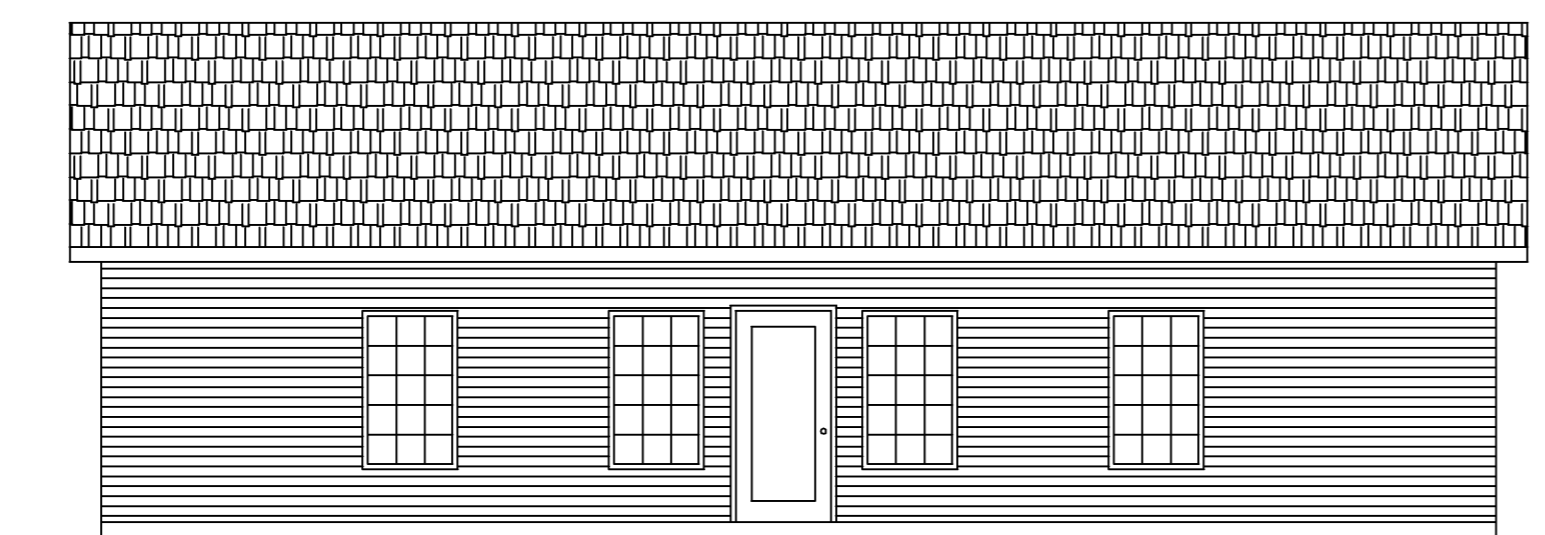
BACK ELEVATION SCALE = 1/8"=1'-0"