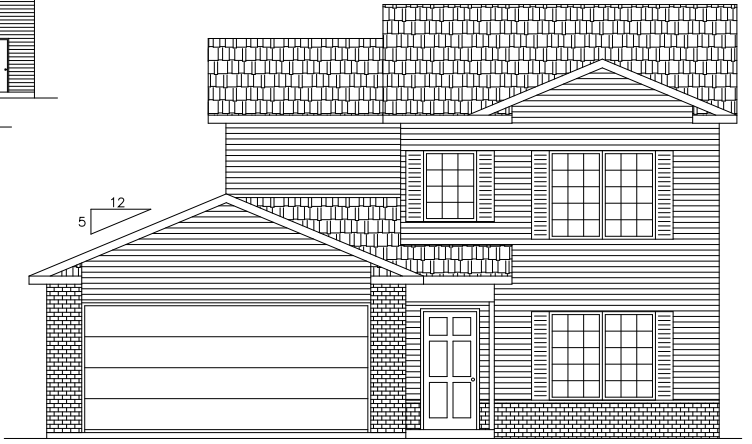
FRONT ELEVATION SCALE = 3/16"=1'-0"