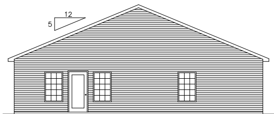
BACK ELEVATION SCALE = 1/8"=1'-0"